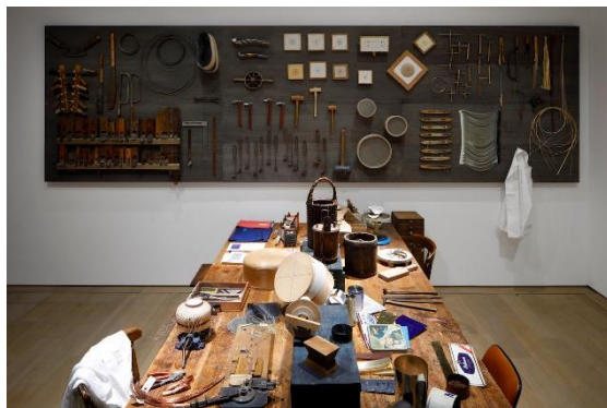
Installation view, Visionaries: Making Another Perspective at Kyoto City KYOCERA Museum of Art