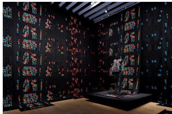
(Left) GO ON, Kyoto Rejuvenation Workshop , 2023, collection of the artists