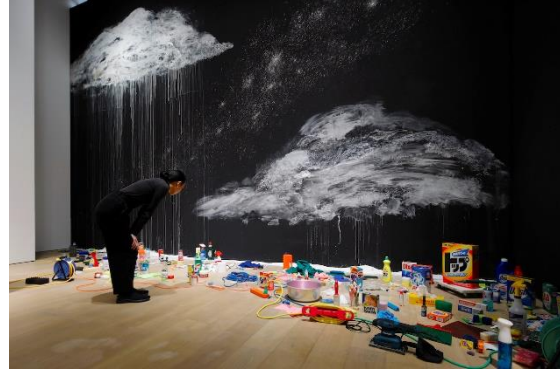
(Left) Installation view, Visionaries: Making Another Perspective at Kyoto City KYOCERA Museum of Art