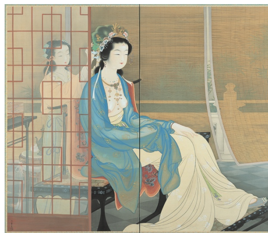
Yang Guifei, one of the Four Beauties of ancient China , 1922, Shohaku Art Museum