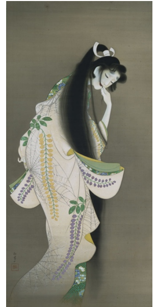
Flame of Jealousy , 1918, Tokyo National Museum

This painting depicts a highly elegant and subdued dance performed with Noh theater chanting. The graceful yet resolute elegance of the performer's cool tension extends through her fingertips to her fan held in an outstretched hand. Presented with minimal and graceful movement, this beautiful figure is a rare Uemura's rendition of a modern woman.