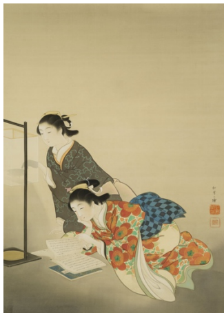
Long Night , 1907 Fukuda Art Museum