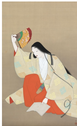
Lady Komachi Washing Away a Poem 1937, Tokyo University of the Arts