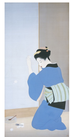
Late Autumn , 1943 Osaka Municipal Museum of Art