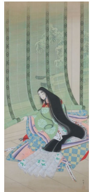
Lady Sei Shonagon , 1895, KITANO MUSEUM of ART

First public showing of Sei Shonagon (1917-18, private collection), a Taisho period masterpiece created between Flower Basket (Inspired by Noh-Play) (1915) and Flame of Jealousy (1918). Though the existence of this work was known, it had been long lost. It has never previously been exhibited.