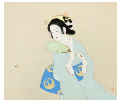
Evening in Early Summer , 1949, Kyoto City Museum of Art

Available through all ticket agencies: Museum official website for online tickets, Lawsons Ticket (L code:55001), Ticket Pia (P code 685-628), E-plus, Seven Tickets, CN Play Guide, Rakuten Tickets, All major convenience stores, etc.