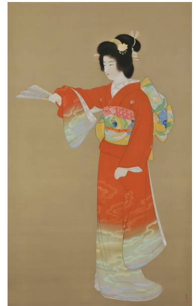
Jo-no-mai (Dance Performed in Noh Play) , 1936, Tokyo University of the Arts Important Cultural Property

For the 100 th anniversary exhibition in 1974, Uemura Shoen's son Uemura Shoko, also a Nihonga painter, selected forty-seven major paintings as well as sketches and notebooks for showing.