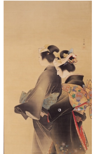
The Flowers of Life , 1899, Kyoto City Museum of Art

Discount: ¥100 discount with reciprocal exhibition ticket or ticket stub