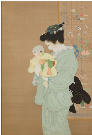
Mother and Child , 1934 The National Museum of Modern Art, Tokyo, Important Cultural Property