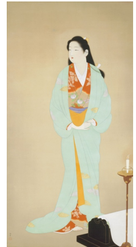
Scene from the Noh Play 'Kinuta' , 1938 Yamatane Museum of Art