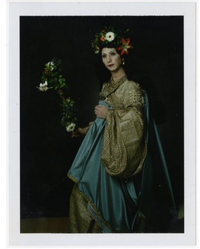
From the series My Self-Portraits as a Theater of Labyrinths , 1984-