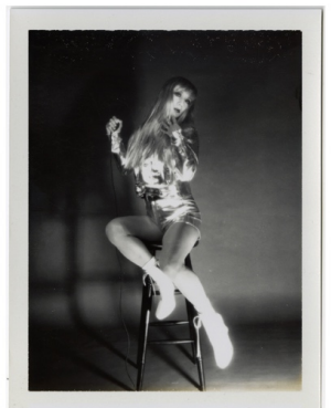
All images above from the series My Self-Portraits as a Theater of Labyrinths , 1984- © Yasumasa Morimura