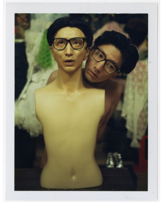
From the series My Self-Portraits as a Theater of Labyrinths , 1984-

*Figures in ( ) are rates for advance sales and for groups of over 20 persons